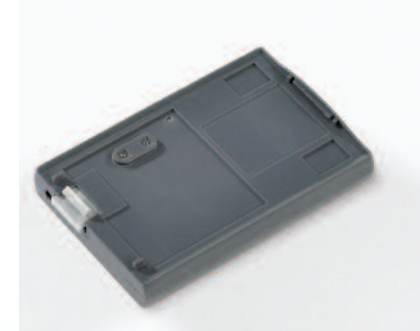
IRC1731 Battery Pack (sold separately).